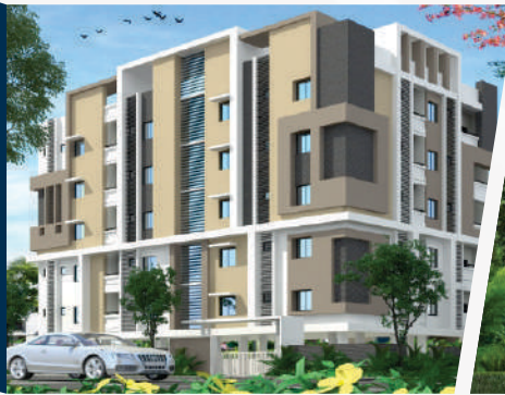
AKSHAYA @ SUCHITRA