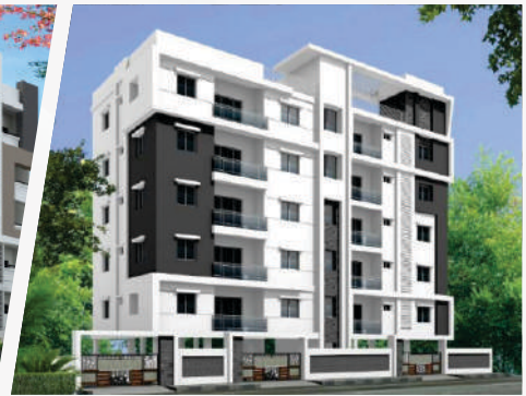
PADMA BLOSSOMS @ MANIKONDA